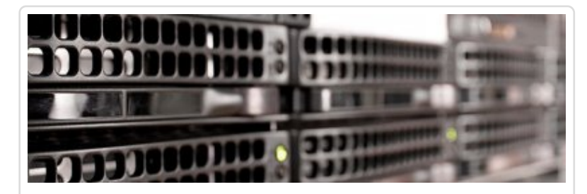
Top LL.M. Programs in Technology Law